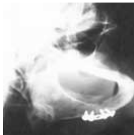
LOWER MAXILLA. The anterior part is not over-penetrated.