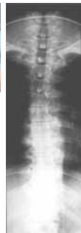
T-1 to T-3. On patients with prominent lower chest, these over-exposed vertebrae are protected by the inverted BOOMERANG.